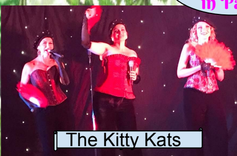
The Kitty Kats