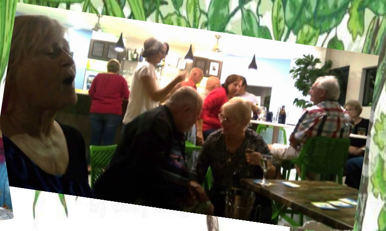
Some of the residents enjoying the entertainment at the Oasis Bar & Lounge