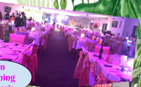
An Evening in Paris