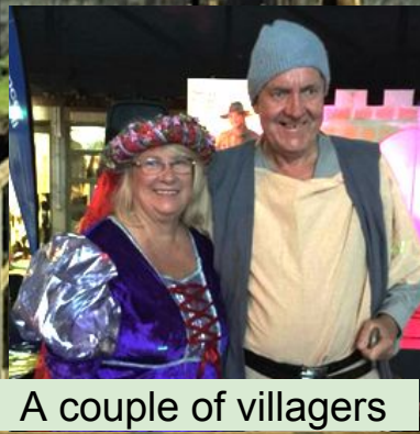
A couple of villagers