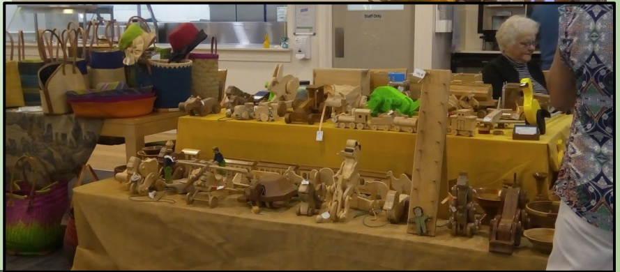
Enjoying Market Day inside and outside with the stalls and free coffee and sunshine.