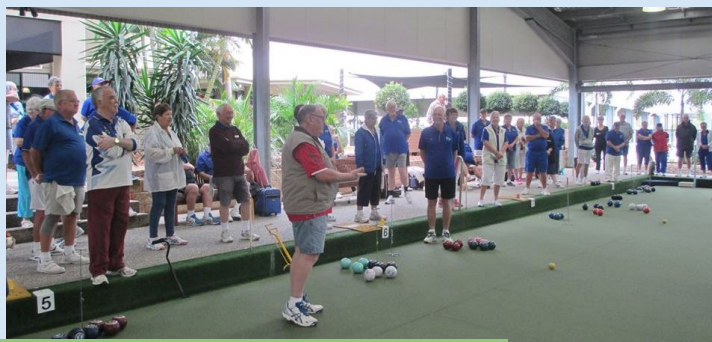
Bowlers waiting to start playing in the Ladies V Men fun game