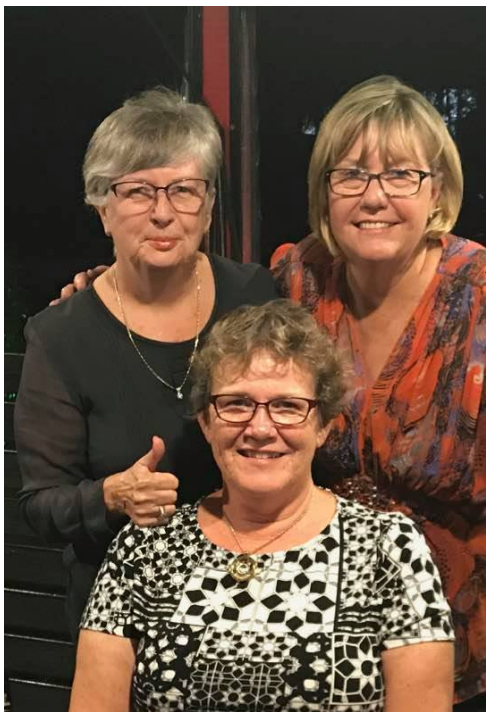
The Happy Birthday ladies.