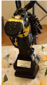
The PLR Melbourne Cup Trophy

There is the PLR Bargara Cup, the race starts at 11.00am, cash prizes for the winners of the PLR Melbourne Cup. Also the winner has their name engraved on the trophy