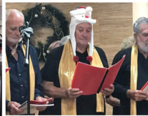
The PLRB Singers entertained us with Christmas Carols