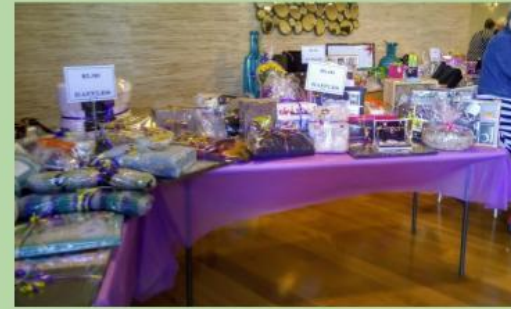
There were around 100+ prizes up to be won

The "Young at Heart" PLRB Relay for life team, Morning Tea fundraiser function on Monday 3rd June in the Sea Breeze.