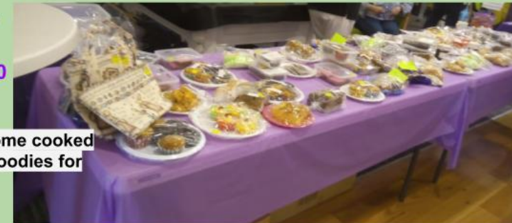
There were lots of home cooked cakes biscuits and goodies for sale.

The "Young at Heart" PLRB Relay for life team raised a massive $4,980.20