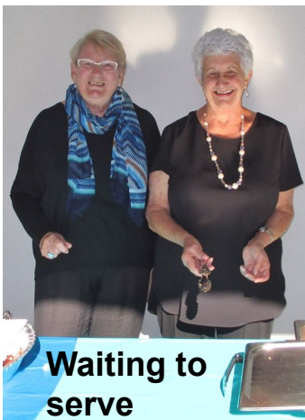
Waiting to serve

What a great way to celebrate Fathers Day with so many turning up for breakfast at the Sea Breeze Club house and a big thanks to all involved who gave their time to make it such a success. Thanks to the Palm Lake Choir for entertaining us all with their beautiful renditions of some popular songs.