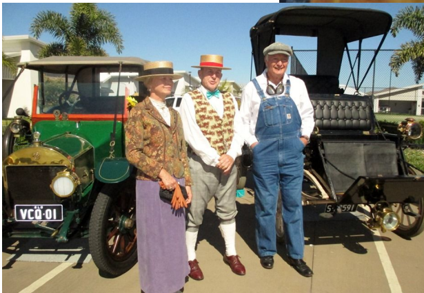
Vintage cars on display