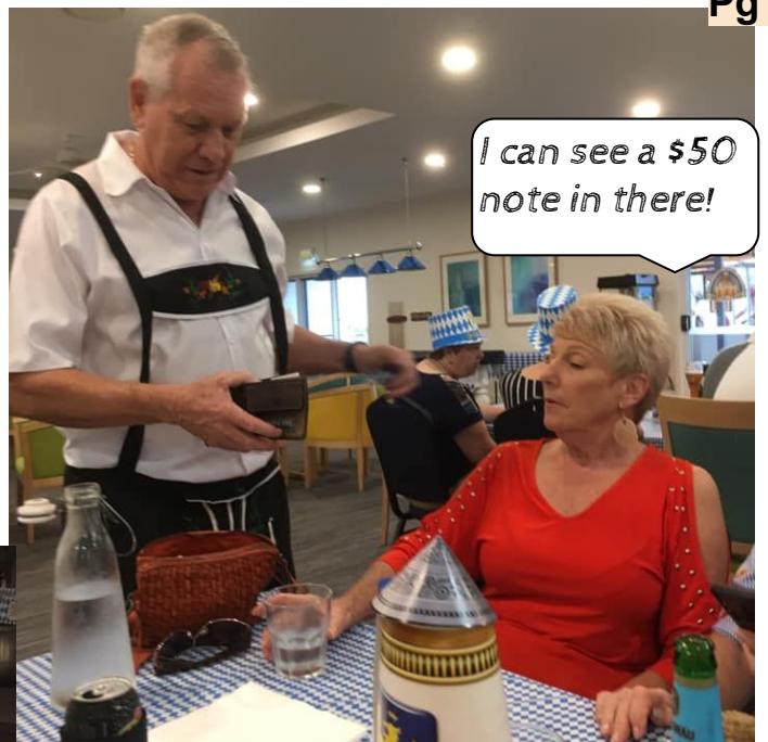
I can see a $50 note in there!