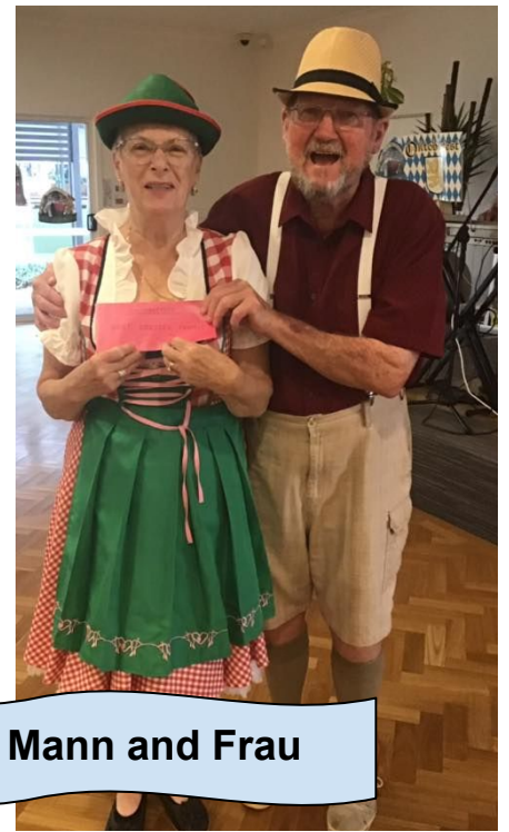
Bestekleidet Mann and Frau