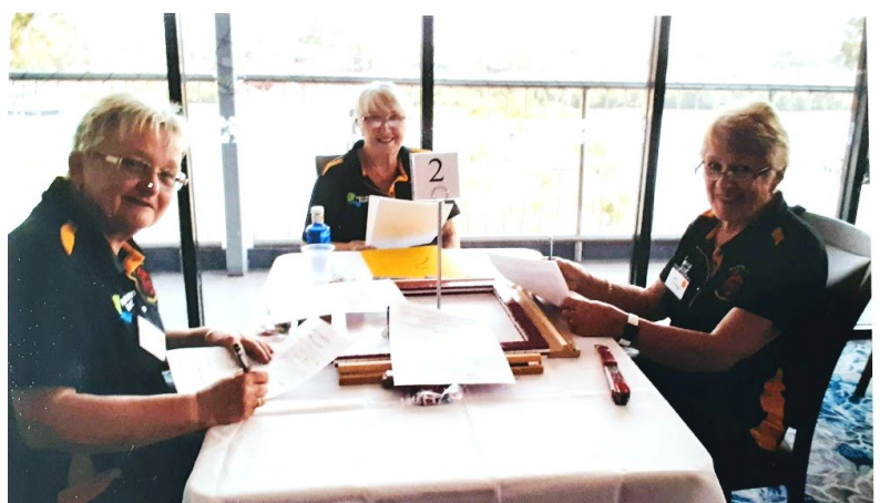
The BARGARA DRAGONETTES at the Competition held at the Bundaberg RSL