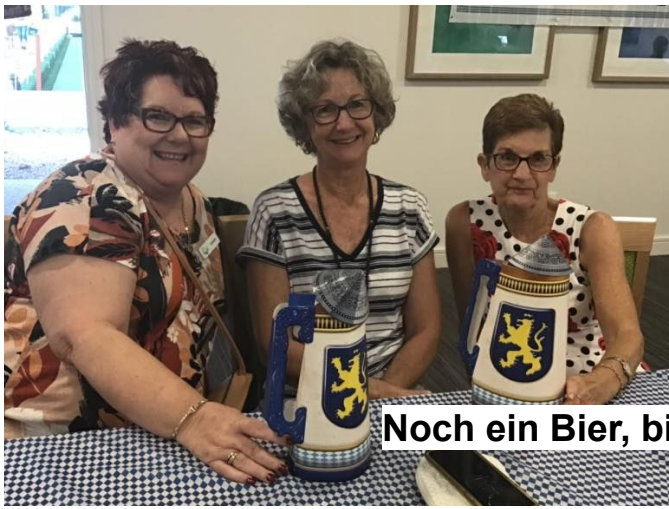
Noch ein Bier, bitte 😊